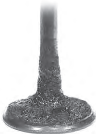
Intake Valve before P.i. Treatment