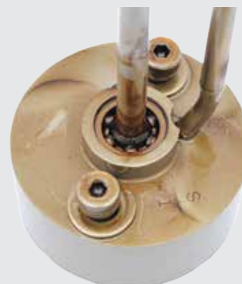
AMSOIL SYNTHETIC MULTI-VISCOSITY HYDRAULIC OIL (ISO 46)