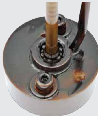
LEADING CONVENTIONAL HYDRAULIC FLUID (ISO 46)