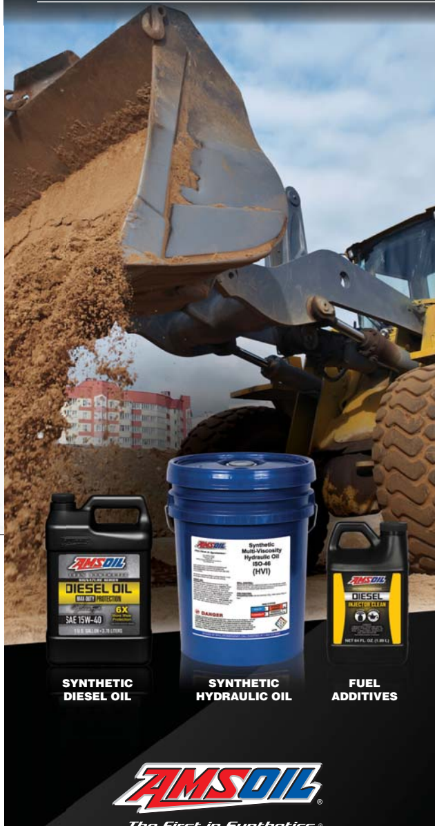
SYNTHETIC DIESEL OIL