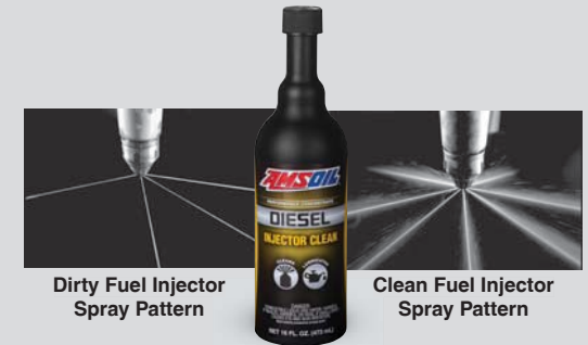
Dirty Fuel Injector Spray Pattern

Diesel Injector Clean also provides added lubricity, helping protect fuel pumps and injectors against premature failure.