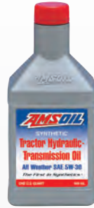
Qualifies as a Universal Tractor Transmission Oil (UTTO)

A typical Universal Tractor Transmission Oil (UTTO) has to simultaneously lubricate gears and hydraulic system components, support the wet braking system, inhibit corrosion, resist water and act as a medium for generating elevated hydraulic pressures to operate ancillary equipment. The lubricant's performance is especially critical to proper operation of hydrostatic transmissions. It takes a precision formulation to meet these demands, and AMSOIL formulates Synthetic Hydraulic/Transmission Fluid with the advanced synthetic technology needed to maximize equipment performance and life.